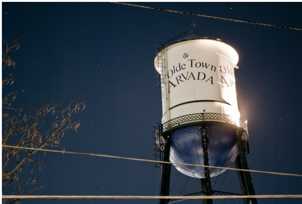
Arvada welcomes fall fun.

Come join us for these exciting September events in Arvada